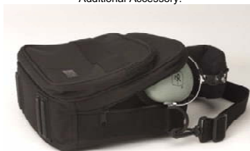
40688G-08 Headset Carry Case