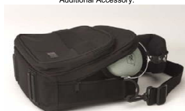
40688G-08 Headset Carry Case