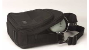
40688G-08 Headset Carry Case